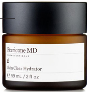
skin clear hydrator PERRICONE MD

Feels amazing on your face. Combines anti-aging benefits with a light texture.