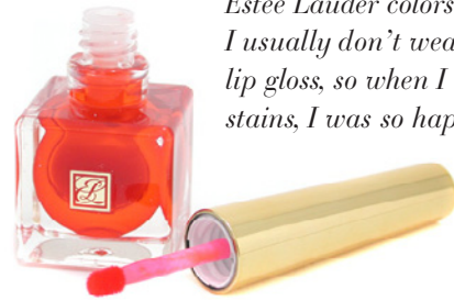
pure color lip tint in mandarin kiss ESTEE LAUDER

Estee Lauder colors are the best. I usually don't wear lipstick or lip gloss, so when I discovered lip stains, I was so happy.