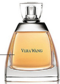
eau de parfum VERA WANG

My favorite smell. I don't even use anything else.