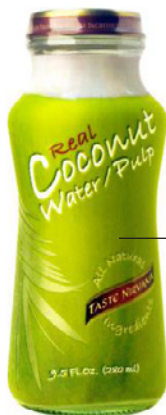
coconut water TASTE NIRVANA

Coconut water is a great source of healthy fiber, electrolytes, potassium and iron. Not only is it good for you, it's tasty too!