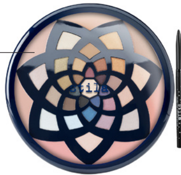
dream in full color palette STILA

I never run out of eyeshadow and it comes with a book that shows you a step by step direction on how to apply certain colors. I love it!