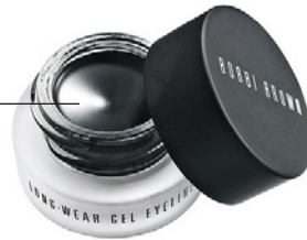
long-wear gel eyeliner in black ink BOBBI BROWN

I love how this eyeliner lasts all day without smearing or creasing.