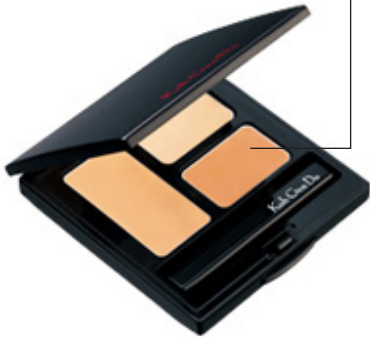
moisture concealer KOH GEN DO

This product evens out my skin tone effortlessly. I always use it before anything else.