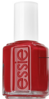
nail polish in really red ESSIE

Because I loooove red nail polish. It's very classy and sophisticated, yet fun and flirty.