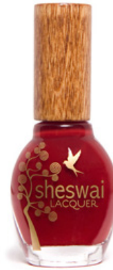
nail lacquer in fersure SHESWAI

Love this sexy deep red shade! And can't get over the cool packaging too!