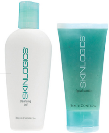
daily facials 20s skin BEAUTICONTROL SKINLOGICS

It makes my face feel fresh every time I use it. None of the BeautiControl products irritates my face or makes it dry.