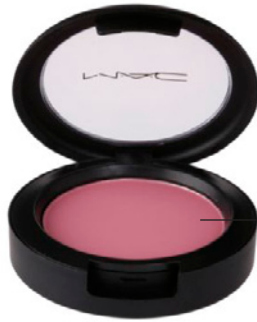
blush in pink swoon MAC

I love this spray! Keeps my makeup fresh, and most importantly, my eyebrows looking good, all day.