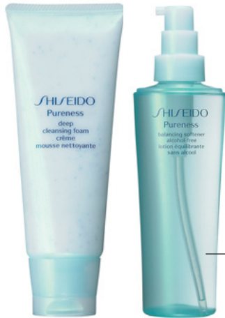
pureness skincare SHISEIDO

I love their soap the best. I use their whole pureness line. I feel like it really deep cleanses my face after a full day of makeup.