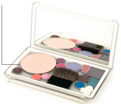
makeup palette UNII COSMETICS

I love having all my products in one compact palette! Makes daily use much easier and faster!