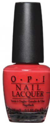
nail lacquer in my chihuahua bites O.P.I.

The perfect bright coral. Reminds me of summer!