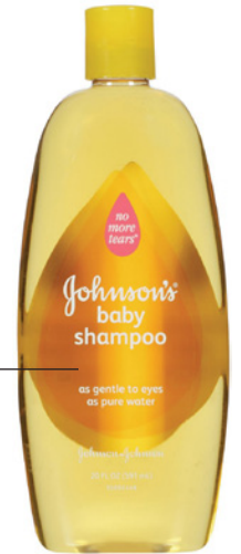
baby shampoo JOHNSON'S

I use this to take off stubborn eye makeup and to clean all my brushes!