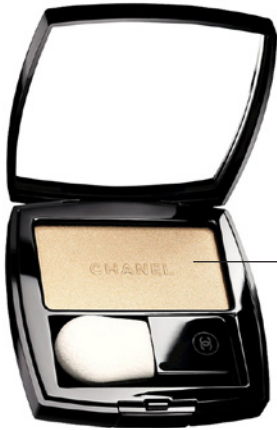
pearl glow powder CHANEL

I love this powder, because I feel like it gives a good glow. I've used other brands and it would make my face too shiny or oddly shimmery, but this one gave me the perfect amount.