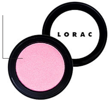
blush in desire LORAC

I love having all my products in one compact palette! Makes daily use much easier and faster!