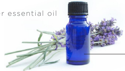
lavender essential oil

Lavender is both soothing and antibacterial – great for calming existing breakouts and preventing them. Dilute it with water before applying directly on irritated areas, because it can dry out the skin. But it works wonders.