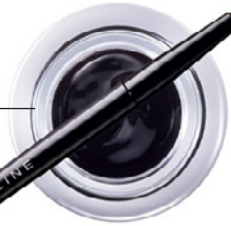
gel eyeliner in black MAYBELLINE

I like how it doesn't smudge and glides on smoothly.