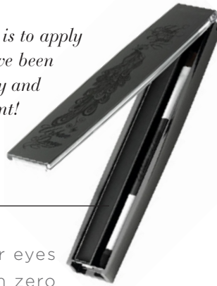
ink for eyes cream eyeliner in zero URBAN DECAY

I love how easy it is to apply with the brush. I've been using it religiously and barely made a dent!