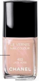
nail colour in jade rose CHANEL

Estee Lauder colors are the best. I usually don't wear lipstick or lip gloss, so when I discovered lip stains, I was so happy.